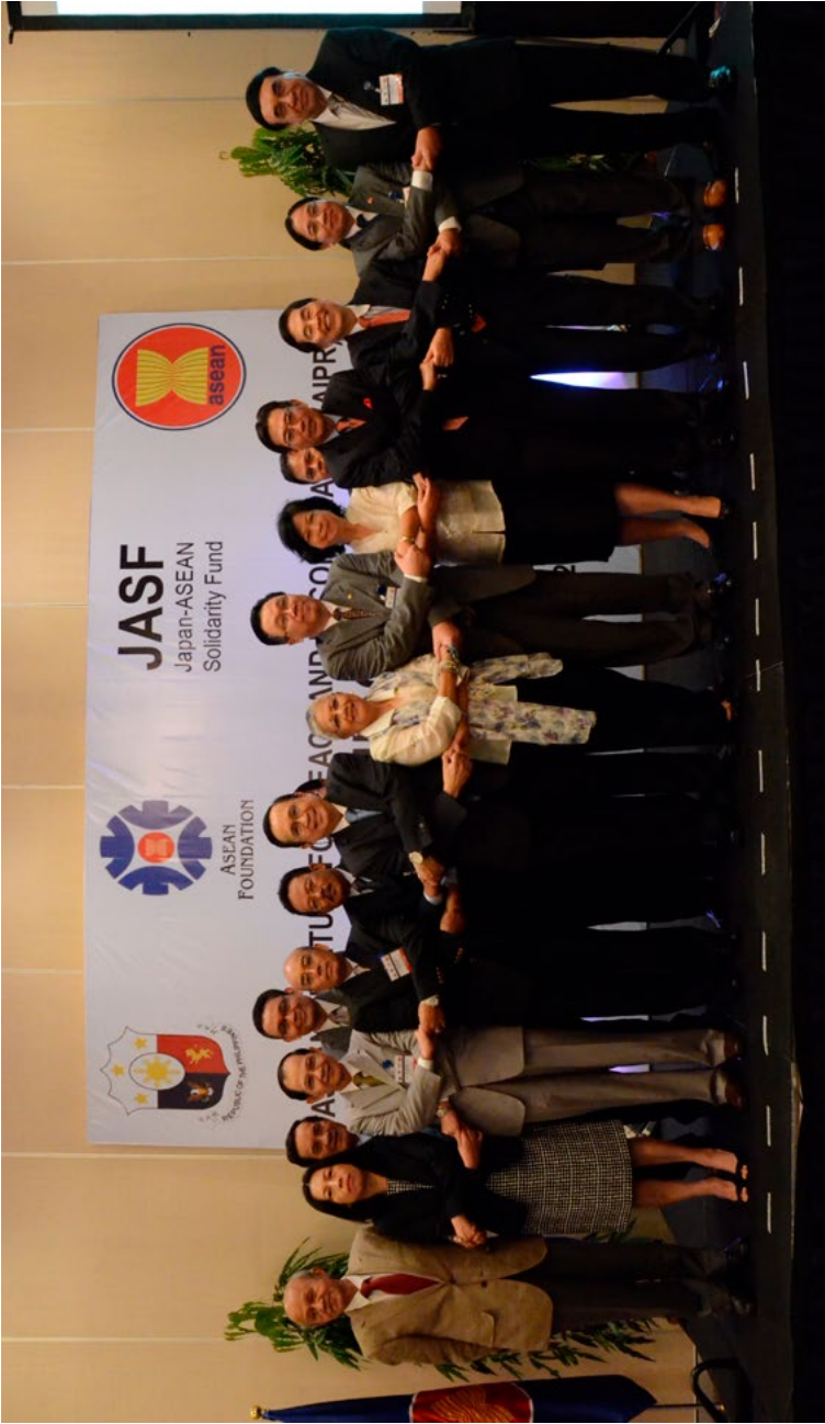
In a show of solidarity, members of the AIPR Governing Council and Advisory Board hold hands in the ASEAN Way at the start of the symposium.