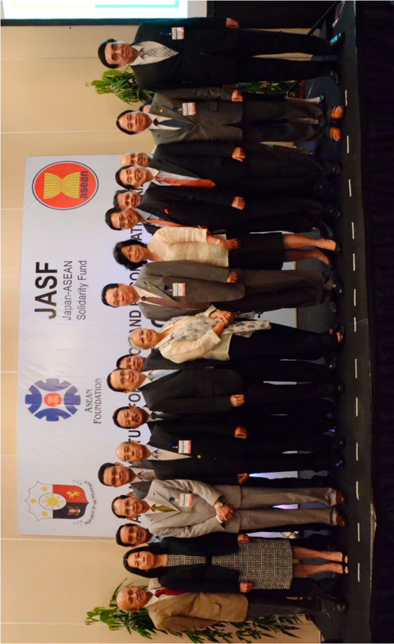
The Members of the Governing Council and Advisory Board of the ASEAN Institute for Peace and Reconciliation (AIPR)