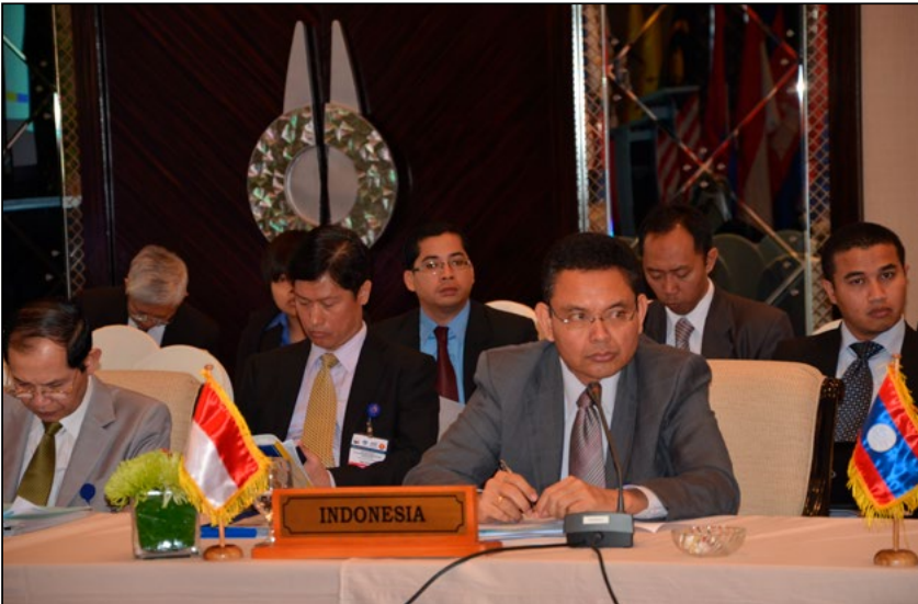
Members of the AIPR Governing Council and Advisory Board listen intently to the presentations given by invited speakers during the symposium.