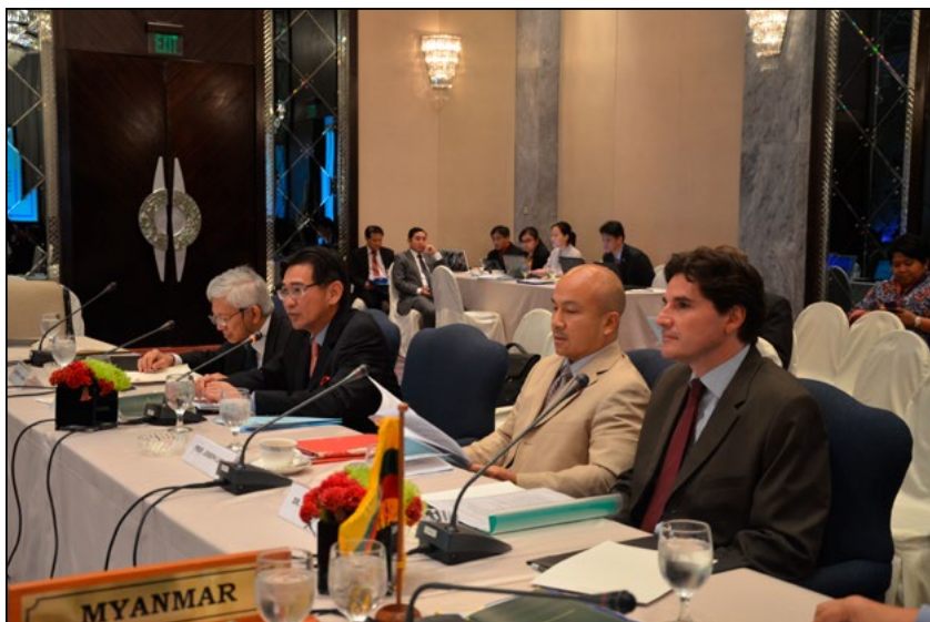
Members of the AIPR Governing Council moderate the discussions during the open forum after the presentations made by the speakers.